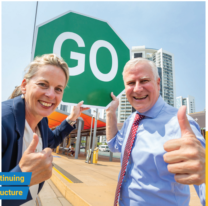
Angie Bell MP with Deputy Prime Minister the Hon Michael McCormack MP at Broadbeach South light rail station.

"We're supporting jobs and we're continuing our track record of delivering infrastructure for the Gold Coast community."